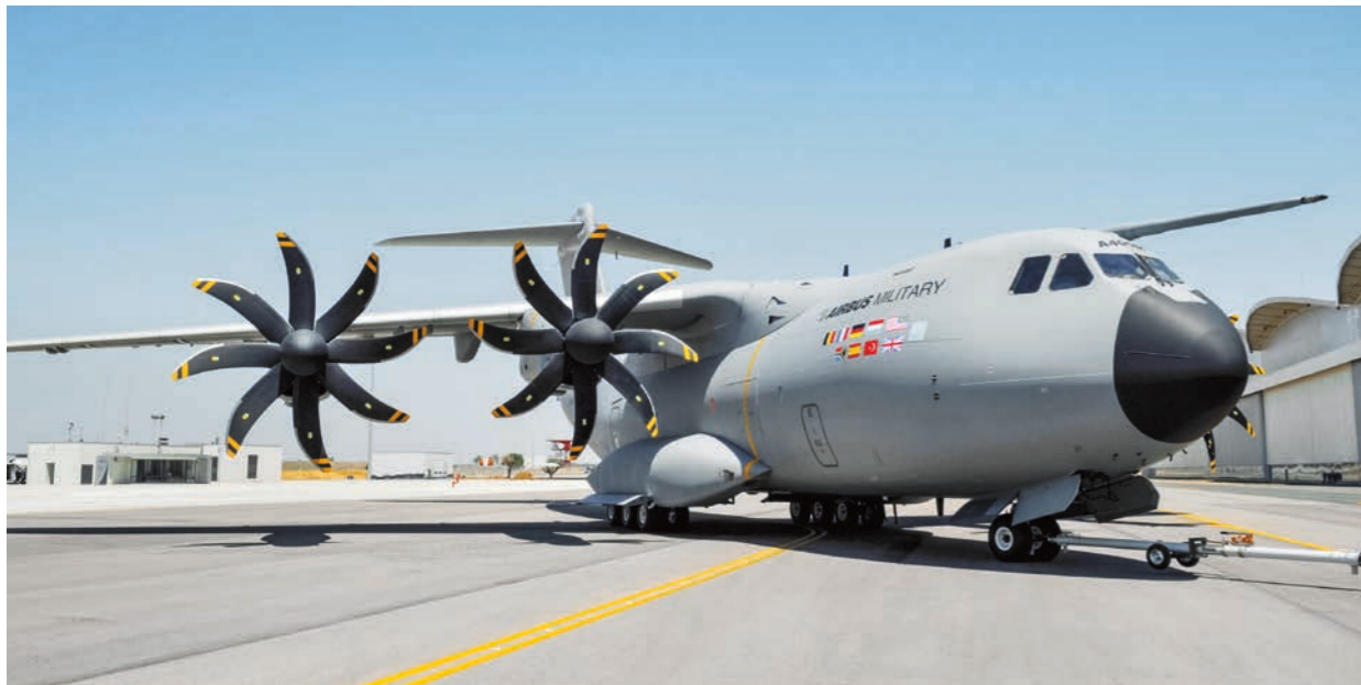
MTU keeps the TP400-D6 engines of the Airbus A400M running smoothly.