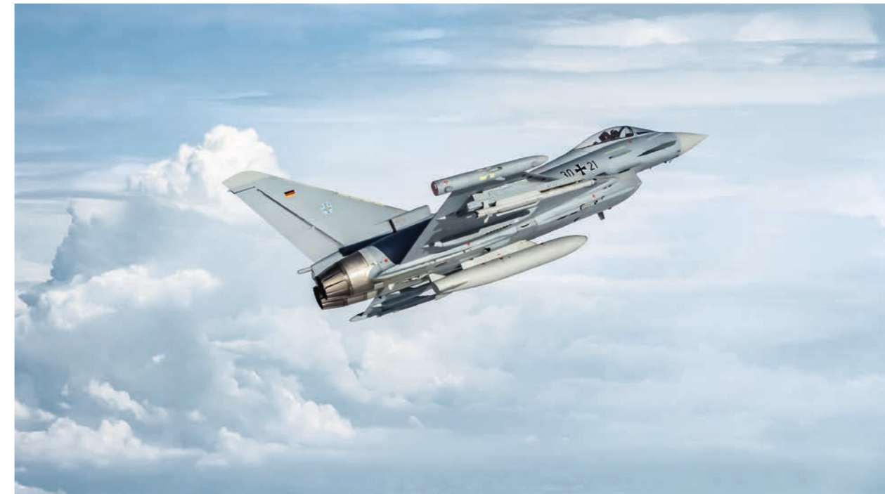
Premium products and excellent performance: That's what MTU stands for.

The company also puts the development of its employees' professional and personal skills high on the agenda. In this way, MTU makes sure its workforce remains highly qualified and internalizes the exacting quality standards stipulated by the company and its military partners—putting them into practice in day-to-day operations and continually developing them. First-class quality management ensures consistently high quality standards across all parts and components. MTU holds the approvals listed to the left authorizing the company to develop, manufacture and repair airworthy engine components and modules.