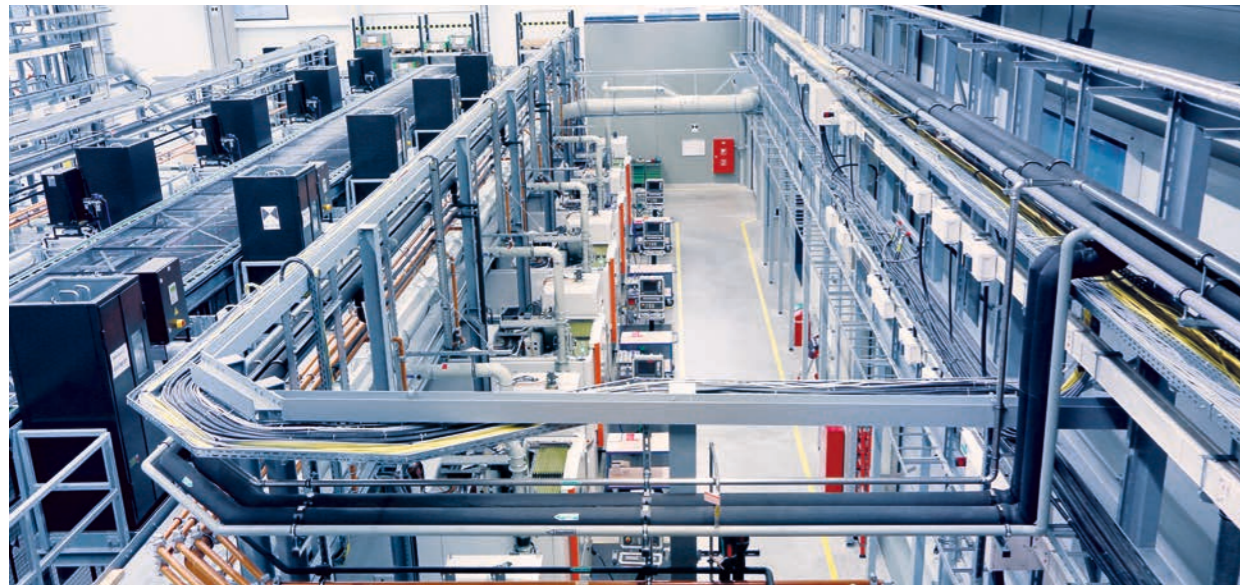
Titanium blisks are made in the blisk center of excellence in Munich, the world's most modern production facility of its kind.