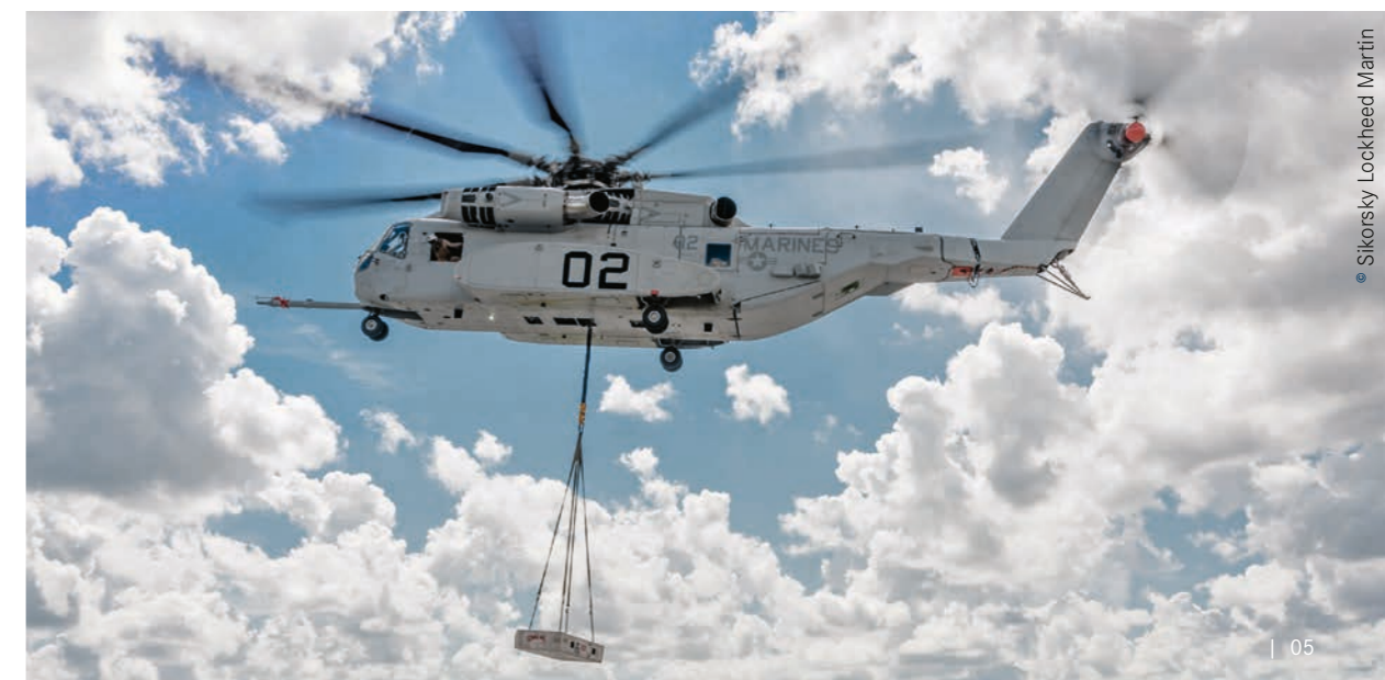
Three T408 engines deliver all the power the CH-53K transport helicopter needs.

As a risk-and-revenue-sharing partner of GE Aviation, MTU holds stakes in the F414, F110 and T408 programs. MTU's workshare in the T408 for the Sikorsky CH-53K heavy-lift helicopter, the latest model in the CH-53 series produced by Lockheed Martin, marks another milestone in its collaboration with its U.S. partner. MTU develops and manufactures the power turbine—the first time it has full responsibility for an entire module in a U.S. military engine program. Compared to its predecessor, the T64, the T408 is 1.7 times more powerful and delivers an 18 percent reduction in specific fuel consumption. MTU Maintenance Canada cooperates with GE Aviation in the maintenance of F108 engines and also looks after the U.S. Air Force's F138 engines.