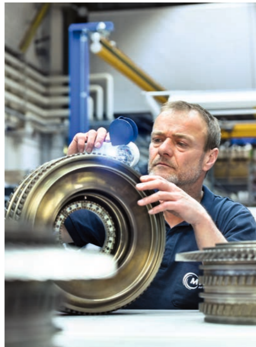
Careful scrutiny: The human eye is and will remain an important inspection instrument.

As a technology leader, MTU has a reputation for reliability and excellence in all its products and services.