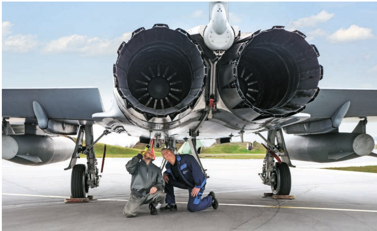
EJ200 teamwork: Specialists from the German Air Force work side by side with MTU experts as part of their collaboration.

Strong together: The maintenance cooperation with the German Armed Forces is a model of success.