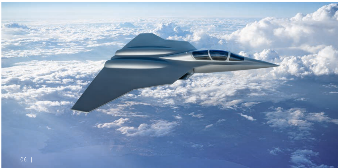
The future in the skies: The next-generation fighter aircraft.

The requirements of the new fighter aircraft call for innovative technologies in engine development.