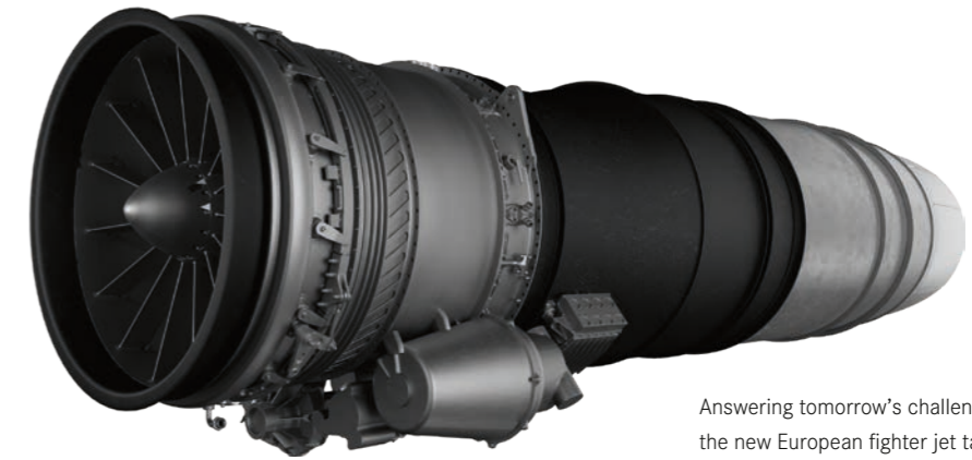
Answering tomorrow's challenges: When the new European fighter jet takes to the skies in 2040, it will need a futureproof, high-performance engine from day one.

The requirements of the new fighter aircraft call for innovative technologies in engine development.