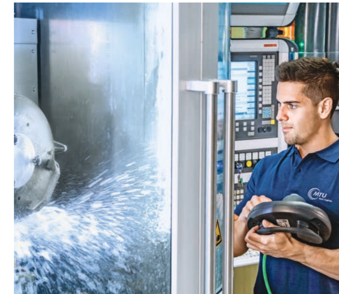
MTU developed not only the PECM process for manufacturing nickel blisks, but the machines as well—currently in operation in Munich.

MTU operates one of the world's most advanced manufacturing facilities for compressor rotors built on the blisk principle.