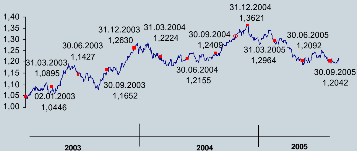
USD daily average exchange rate from 01/02/2003 to 10/31/2005